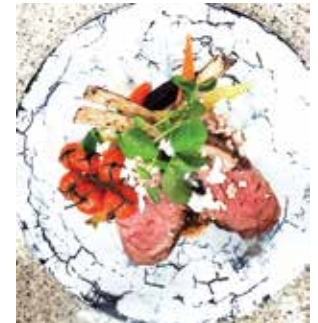
Ontario Lamb Rack