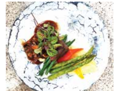
Beef Short Rib

A 13% tax will be applied, gratuities extra. For parties of six or more, an 15% gratuity will be applied. Should you have any allergy concerns, please notify your server.